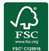
The mark of responsible forestry