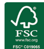
The mark of responsible forestry