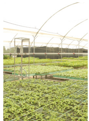
Fig. 1: 3A Composites Core Materials Ecuador balsa nursery overview.