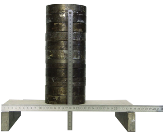
Figure 4: Deflection of BALTEK® VBC core lengthwise load.