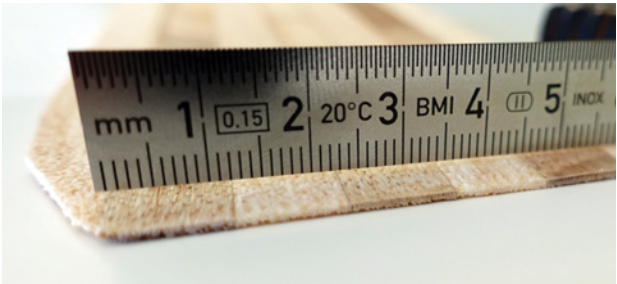
Figure 1: Excellent processing quality to 1mm core thickness without affecting the outstanding engineered wood properties.