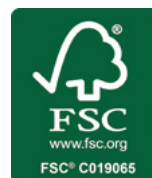
The mark of responsible forestry