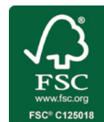
The mark of responsible forestry